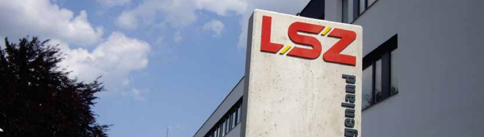
Safety Center Burgenland